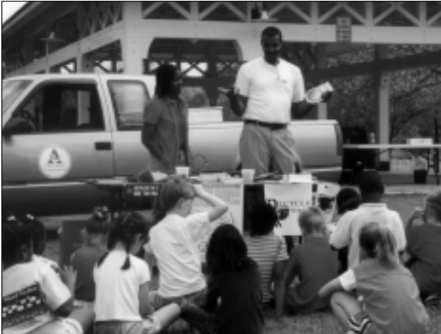
Elementary school children listened to a presentation on recycling.

Children enjoyed learning about the importance of trees, animal control, recycling and water treatment. In addition, students decorated terra cotta pots with an Earth Day theme and planted sunflower seeds in the pots.