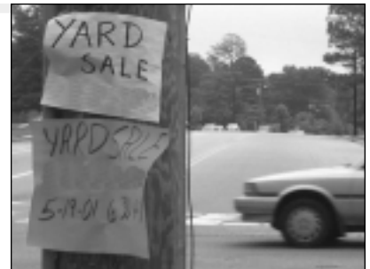
Signs attached to power poles are in violation of the City's ordinance and litter Auburn's streets.

Help keep Auburn clean by refraining from attaching posters to utility poles, traffic control signs, or other structures in the rights-of-way. By working together, we can all do our part to keep Auburn clean.