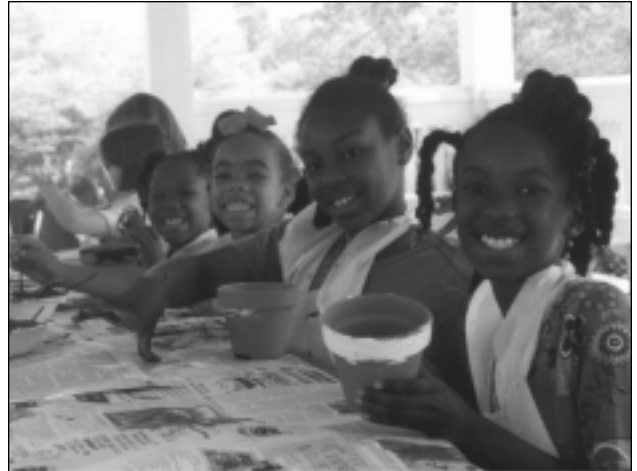
Earth Day participants decorated flower pots and planted sunflower seeds in them.