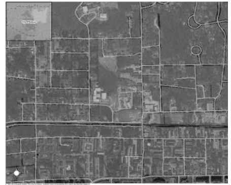
The GIS site will enable citizens to see which school their neighborhood is zoned for as demonstrated in the photo above.

The IMS has been an on-going project for the City's Information Technology Department for a number of months. The site is dynamic and will continually expand to include additional information. The Information Technology Department's GIS Division received a Special Achievement in GIS award in 2004 from ESRI, the world leader in GIS software. The award is given at ESRI's International User Conference and recognizes GIS personnel around the world for their outstanding work in the GIS field. The City of Auburn's GIS Division was one of 150 chosen from among the more than 100,000 ESRI GIS implementations worldwide.